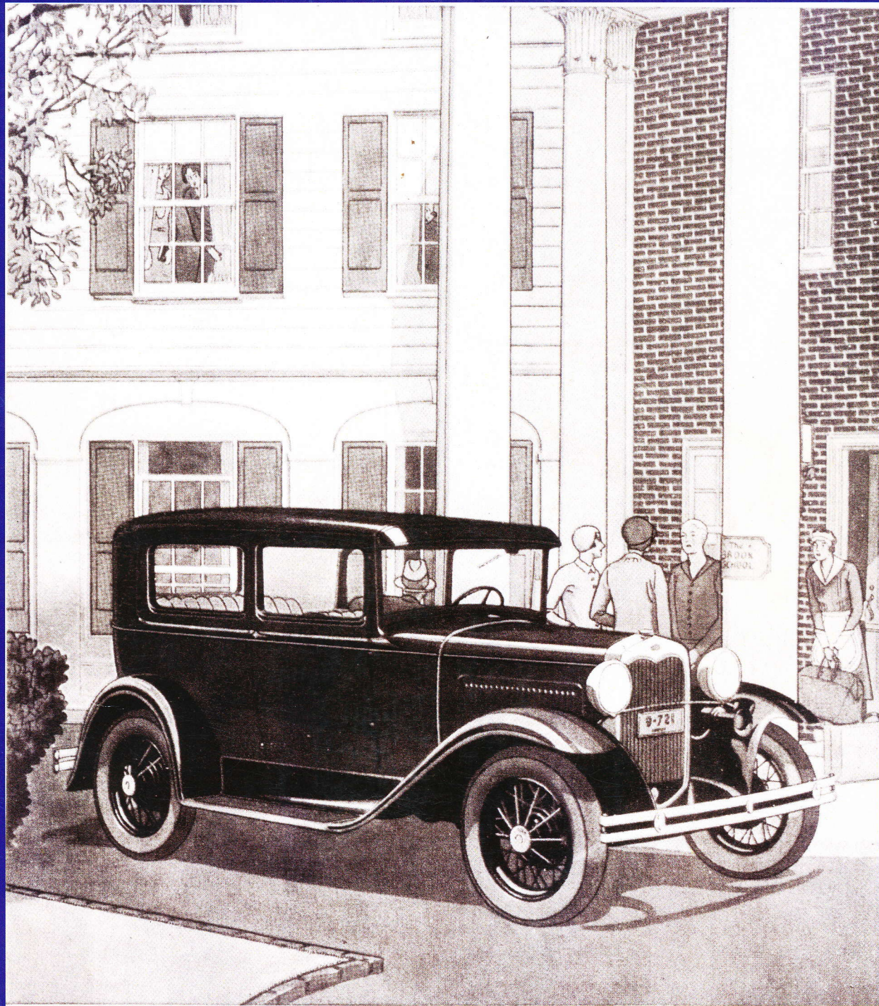
Model A Ford Club of America